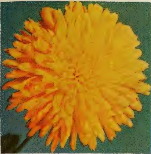
RUTHANN LEHMAN. 60c each; 3 for $1.50